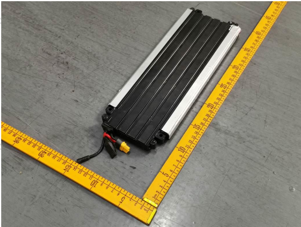
Figure 1 Overall view I of battery