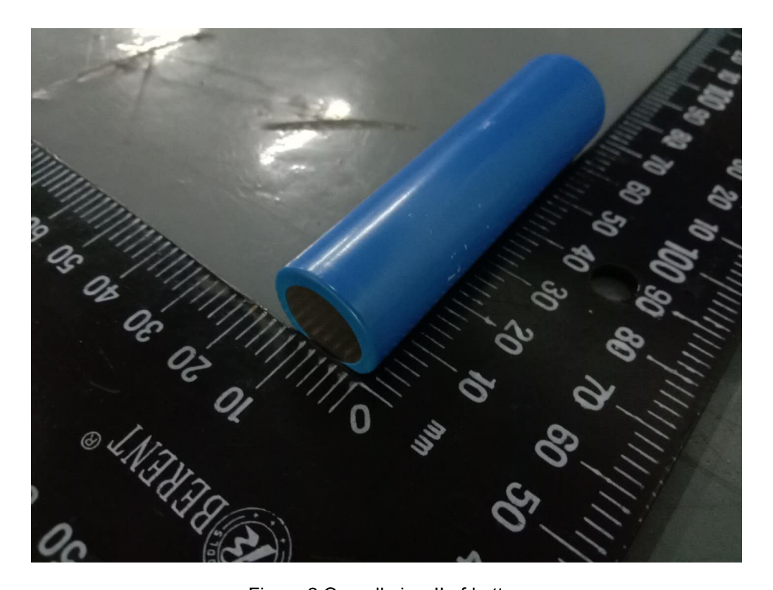
Figure 2 Overall view II of battery