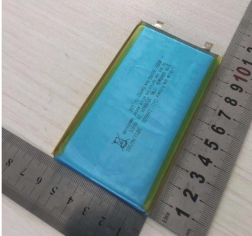
Fig.1 General view I of battery