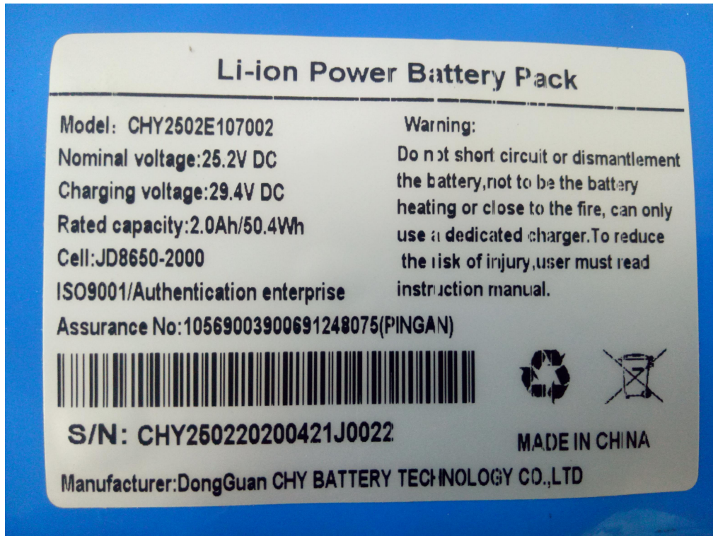
Figure 5 Battery Label