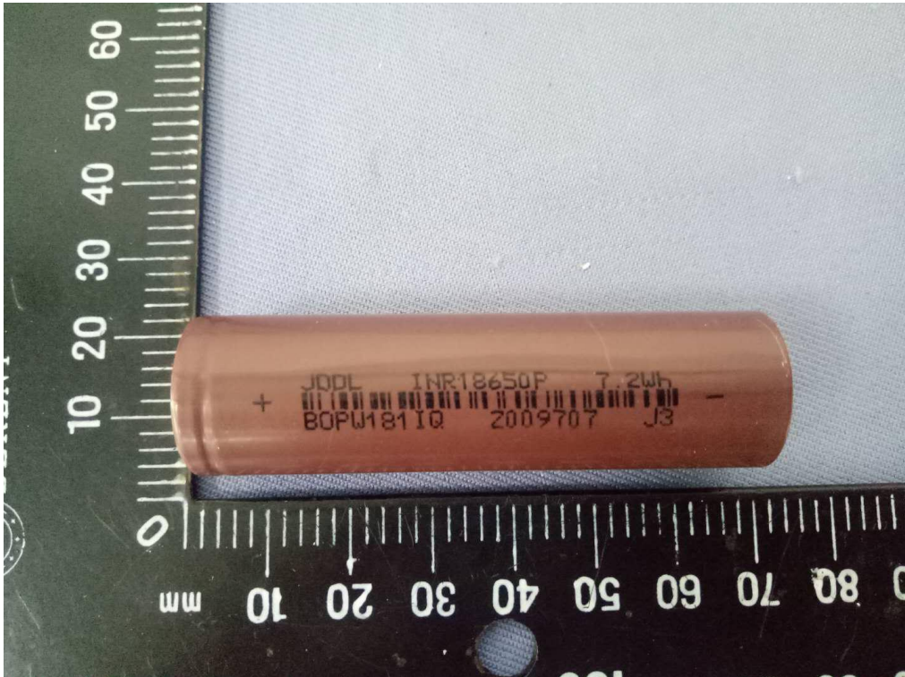
Figure 4 Overall view of cell