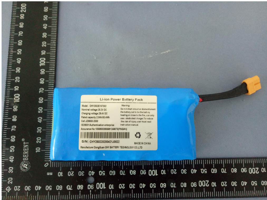
Figure 1 Overall view I of battery