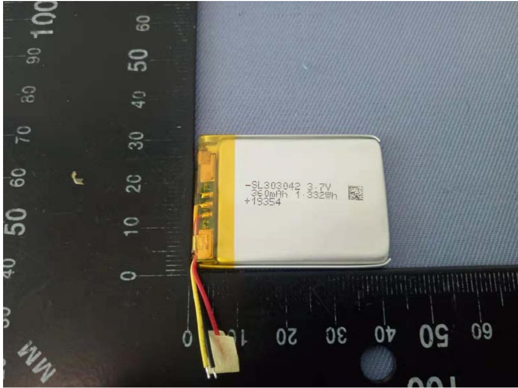
Fig.1 Overall view I of battery